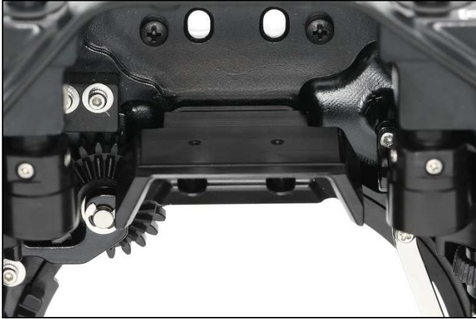
Install the bottom part of the holder back into the housing