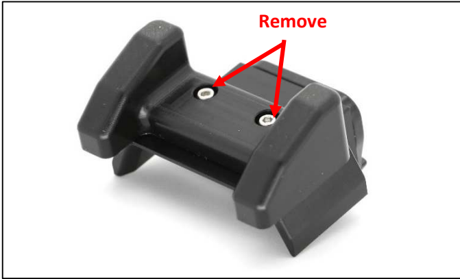
Remove the top part of the holder by removing the two screws.