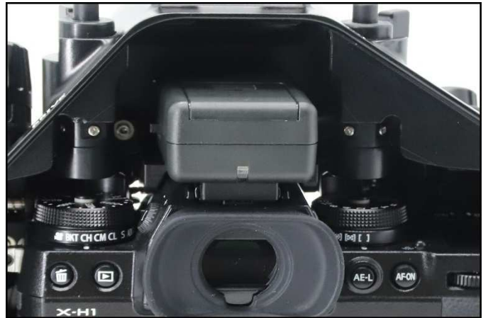
Install the camera with flash trigger into the housing.