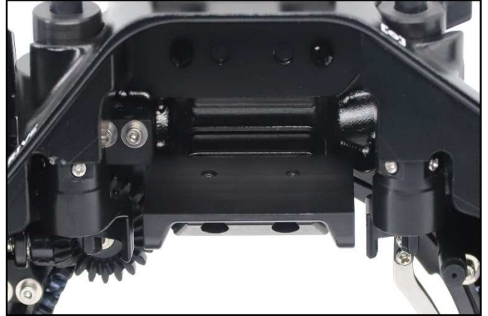
Install the bottom part of the holder back into the housing