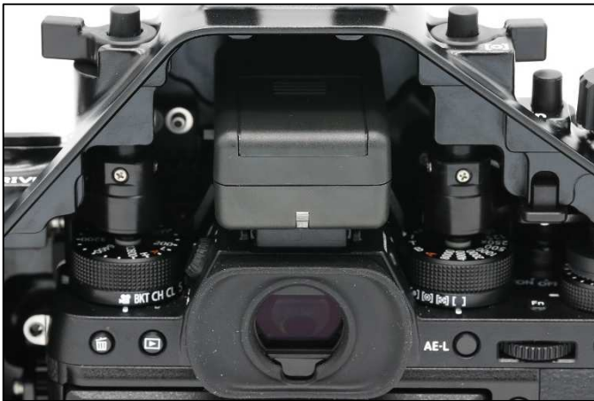
Install the camera with flash trigger into the housing.