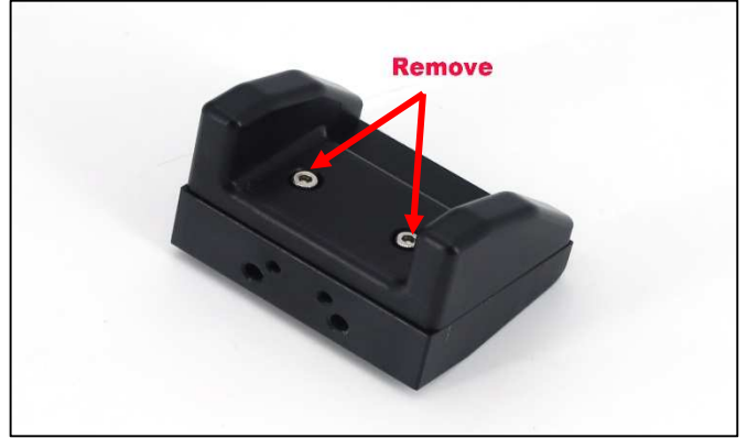
Remove the top part of the holder by removing the two screws